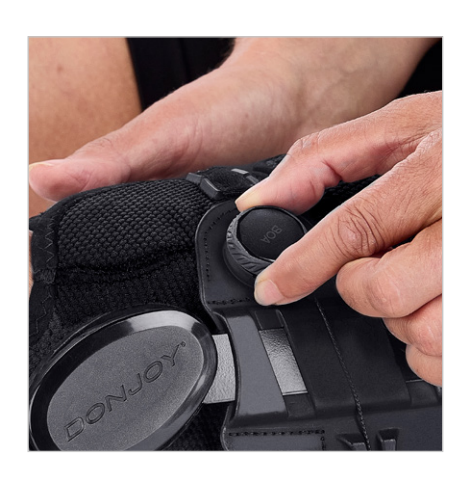
Precision fit and fast release: Twin multidirectional BOA* Li2 dials deliver a precision fit engineered to perform in the toughest conditions. Turn clockwise and counter-clockwise for independent tightening and releasing of thigh and calf areas, or pull up for quick release.