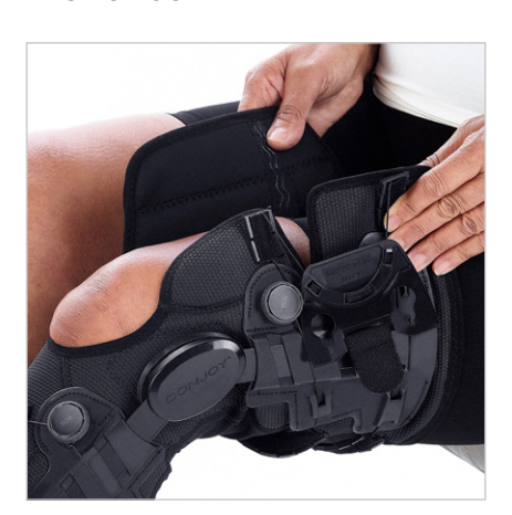
Hybrid sleeve/wrap design: Half wrap, half sleeve, OA GO* combines the benefits of both to make fitting quick and easy. Simply open the thigh section then pull the lower sleeve section over the calf before securing the support with the hook-and-loop fastening.