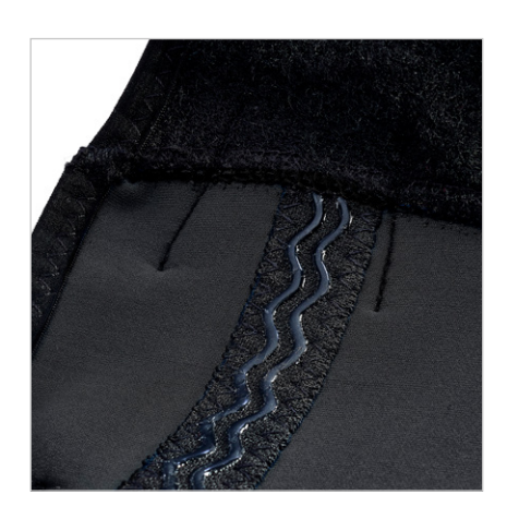
Anti-slip bands: Positioned at the top of the thigh to prevent brace migration and maintain a comfortable fit.

Adhere to the knee anatomy for improved pressure distribution. Two different thicknesses (10mm and 13mm) of condyle pad included to aid individual fit and comfort for varied anatomies.