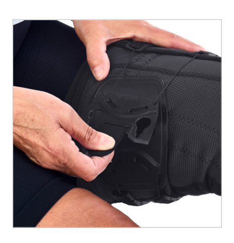
Easy-grip pull tab: Facilitates quick and easy attachment and release of the locking plate, and folds down flat to avoid catching.