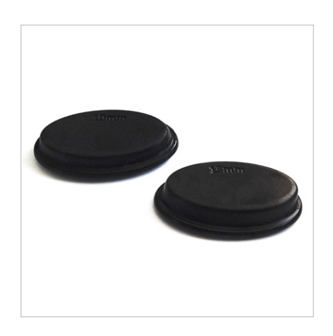
Anatomically contoured condyle pads:

Adhere to the knee anatomy for improved pressure distribution. Two different thicknesses (10mm and 13mm) of condyle pad included to aid individual fit and comfort for varied anatomies.