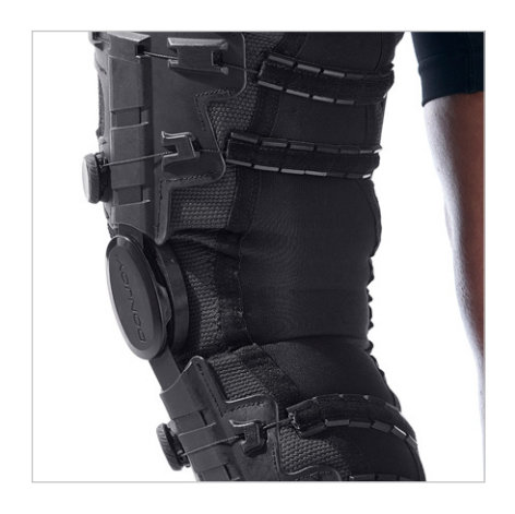
Breathable, stretchable, antibacterial fabrics: Aid comfort, compliance, and hygiene, enabling extended periods of use. Not made with natural rubber latex. Rear lycra section provides additional comfort and freedom over the popliteal fossa.